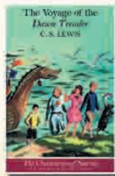
The Voyage of the Dawn Treader