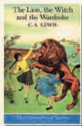
The Lion, the Witch and the Wardrobe