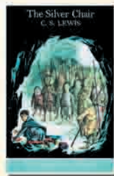
The Silver Chair