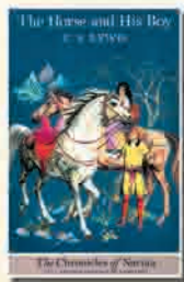
The Horse and His Boy