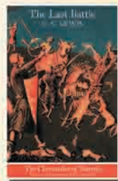
The Last Battle