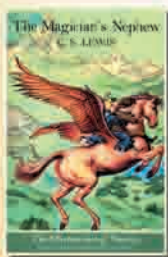
The Magician's Nephew

Enter the World of Narnia with these riveting paperback editions from HarperCollins!